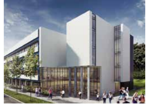
STEM Teaching Building