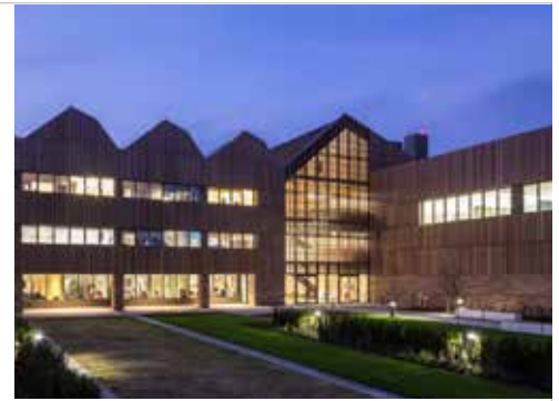
Bob Champion Building